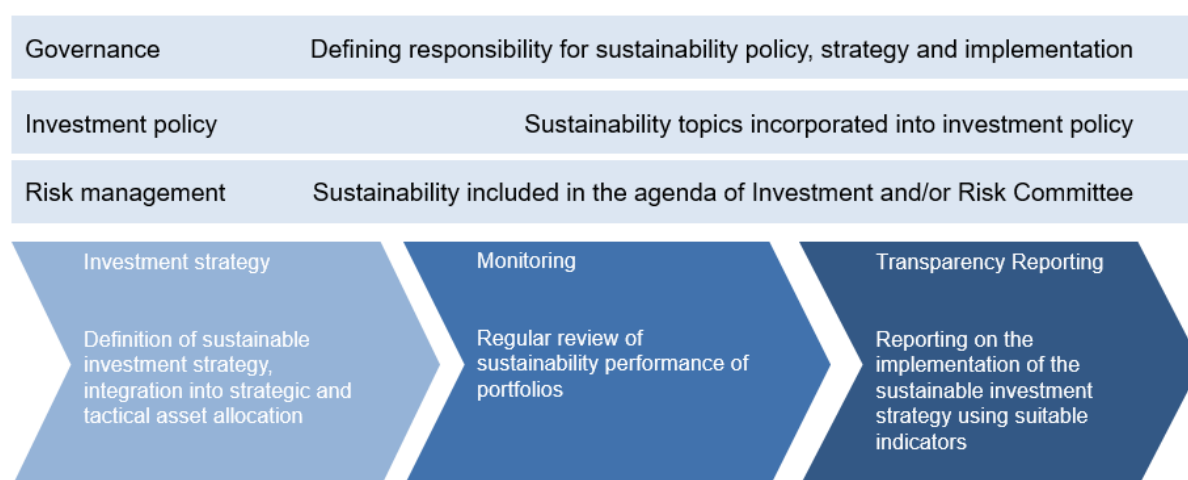
Figure 1: Integration of Sustainability into different elements of the investment process

A sustainable investment process (used in these recommendations as a synonym for responsible investment and ESG investing) contains similar elements to a normal investment process. The following chart provides an overview of the different elements of a sustainable investment process. The subsequent chapters are essentially organised along this order: